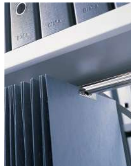
ZT pendel frame