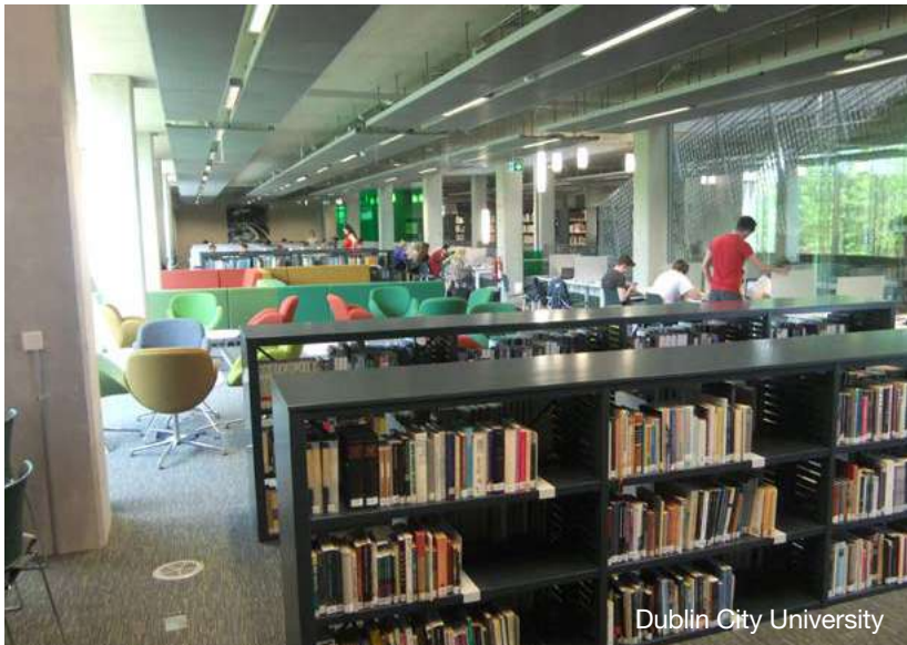
Dublin City University