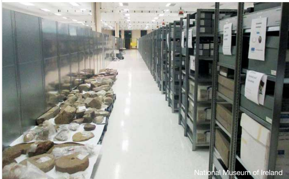
National Museum of Ireland