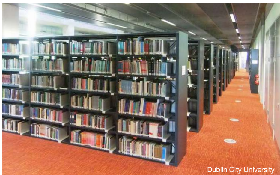
Dublin City University