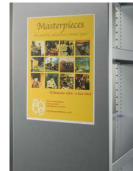
A4 label holder