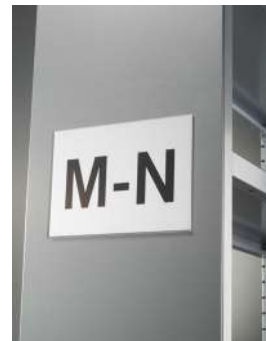
Label holder A5-A6