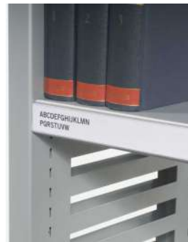
Shelf label- holder