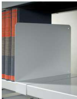
Book support full depth

If you work in a library, it is important that tasks can be carried out both efficiently and ergonomically. Our wide range of accessories ensures that all media can be stored in a well-organised manner.