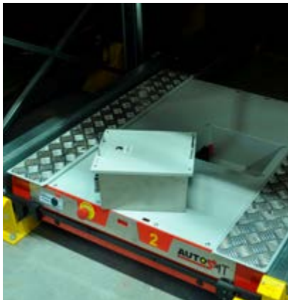
Longlife lithium battery removed for recharging *Shuttle by Autosat