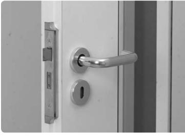
Lock and handle units are integrated;