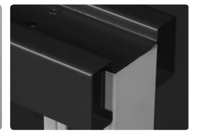
Heavy duty top capping adjustable for height variance and used for tall multi-tier requirements.