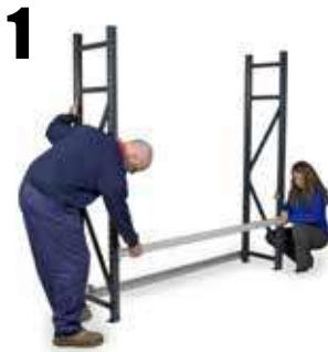
1 Position a pair of frames. Hold them in place with a pair of beams

The system allows you to easily adjust your configuration and shelf heights as your stock changes.