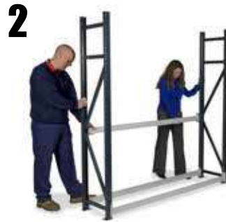
2 Click the remaining beams into place and attach the safety pins