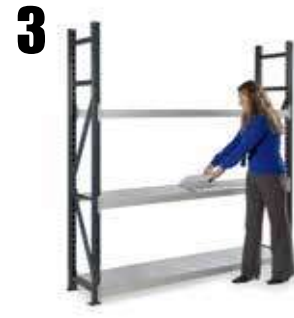
3 Drop in the steel or chipboard shelves