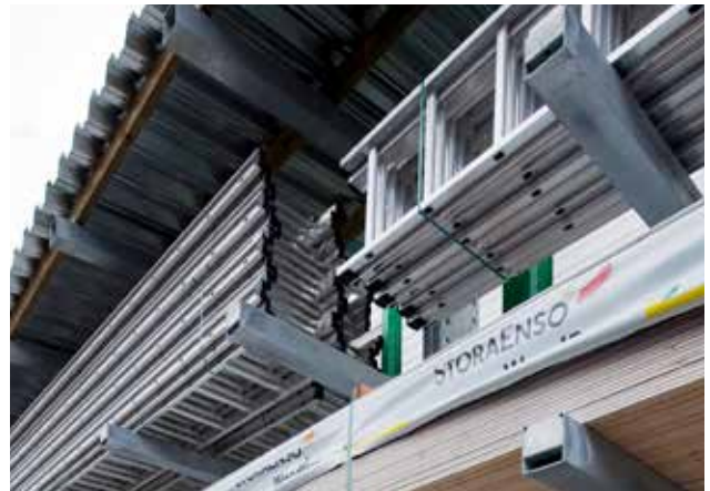
Heavy duty cantilever - Cantilever roof, side and back cladding

Cantilever racking can be mounted on mobile bases saving space while still allowing access to individual items.