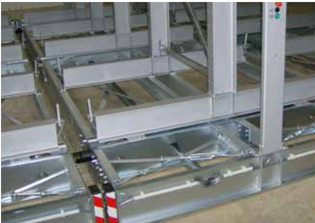
Heavy duty cantilever - Cantilever mobile bases

Preventing items from rolling off the end of the arm and can be removed for improved access to goods.