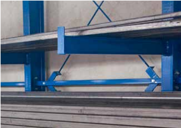
Heavy duty cantilever - Fixed end stopper

Welded end plates are used as a heavy duty solution for stopping the stored items from rolling off the rack.