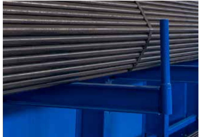
Heavy duty cantilever - Removable round stoppers

Welded end plates are used as a heavy duty solution for stopping the stored items from rolling off the rack.