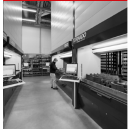
Storage Machines - Tornado