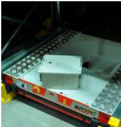
Longlife lithium battery removed for recharging *Shuttle by Autosat