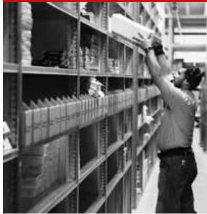
Shelving - HI280