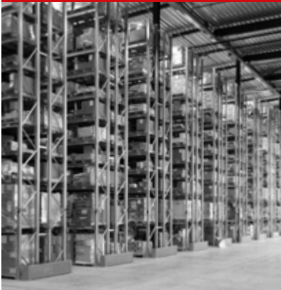
Pallet Racking - P90